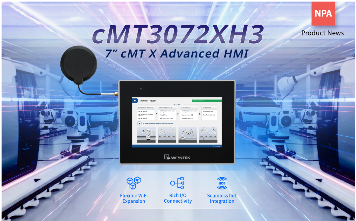
cMT3072XH3: 7" cMT X Advanced HMI

In industrial applications, 7-inch HMIs have long been a market favorite. However, as Industry 4.0 accelerates, even compact machines must handle more complex on-site data and support wireless connectivity.